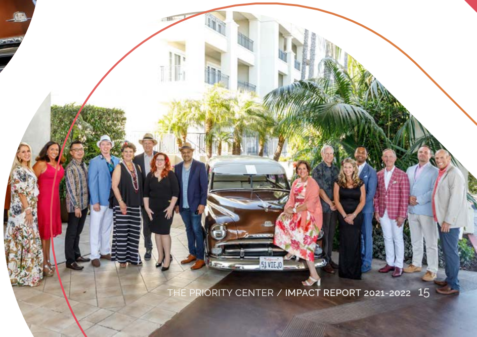
The Priority Center Board of Directors